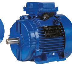
TCT3 Ex tc IE3-IE4 0.75 - 375 kW