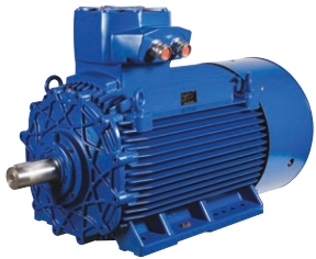
ABr / ACr / E..AB / E..AC Ex db / Ex db eb IE1-IE2-IE3-IE4 0.12 - 375 kW