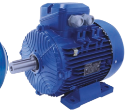
MA / MAH / MAP Marathon® Aluminum IE1-IE2-IE3 0.12 - 18.5 kW