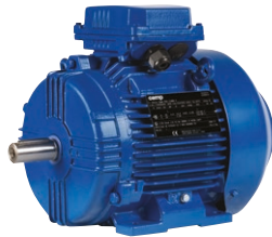
TCE Ex eb IIC T3Gb IE3-IE4 0.75 - 375 kW