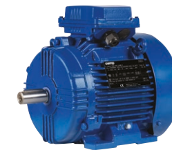
TCI CEMP Cast Iron IE3-IE4 0.75 - 375 kW