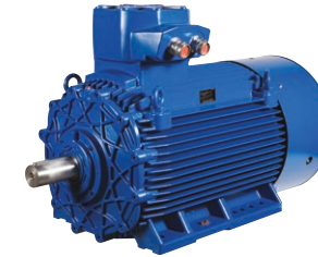
AN / E..AN Ex ec (former Ex nA) IE1-IE2-IE3-IE4 0.12 - 200 kW