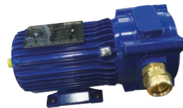
AAB / AAC Ex db (Aluminum frame 56) 0.06 - 0.12 kW