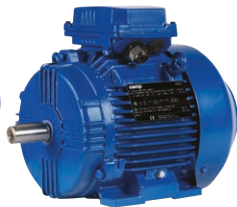
TCT Ex tb IE3-IE4 0.75 - 375 kW