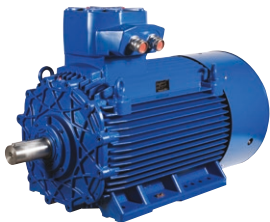
ABr / ACr / AD / E..AB / E..AC / E..AD Ex tb IE1-IE2-IE3-IE4 0.12 - 375 kW