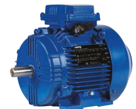
TCN Ex ec (former Ex nA) IE3-IE4 0.75 - 375 kW