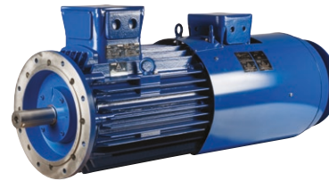
E..DB / E..DC / E..HB / E..HC (Brake) Ex db / Ex db eb IE1-IE2-IE3-IE4 0.18 - 200 kW