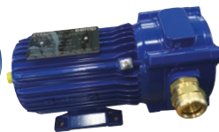
AAB / AAC Ex tb (Aluminum frame 56) 0.06 - 0.12 kW