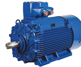
ABr / ACr / AD / E..AB / E..AC / E..AD Ex tc IE1-IE2-IE3-IE4 0.12 - 375 kW